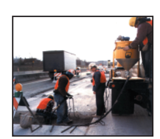
Highway Dowel Rods