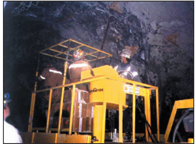
The Model 542H, shown above grouting rock bolts, is ideal for non-flowable cement grouts with water/cement ratios as low as .40 (.35 with Super "P").

Operator controls are centrally located for efficient production. All components are easily accessible for operating, cleaning and maintenance.