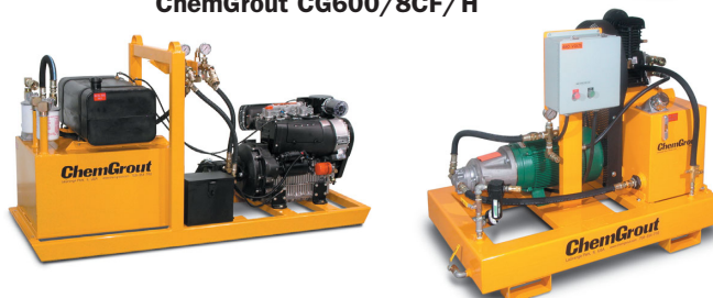
Power Pack Options CG-PU24/DH and CG-PU/EH